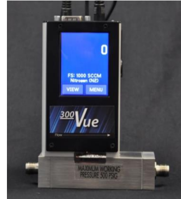
Figure 2 HFM-D-300B Vue Flow Meter w/ Color Touchscreen Display Accuracy: \pm(0.5\%PT+0.2\%FS)

Another important consideration when selecting the proper instrument is avoiding what is known as “fold-over”. This problem arises in some typical flow meters when they actually misreport a very high (over-range) flow as a normal flow, and allow a bad part to pass. Teledyne Hastings’s 300 Series sensor design correctly interprets over-range flows; its output signal will not come back on scale. The HFM-300 will not report false acceptable readings.