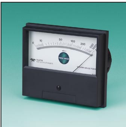
Vacuum Gauge Meters/Controllers